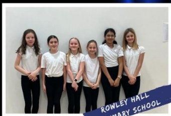
ROWLEY HALL PRIMARY SCHOOL

St Michael's Church of England High School • Rowley Learning Campus • Curral Road • Rowley Regis • West Midlands • B65 9AN Telephone: 0121 561 6881 • Fax: 0121 561 6882 • Email: contact.staff@st-michaels.sandwell.sch.uk