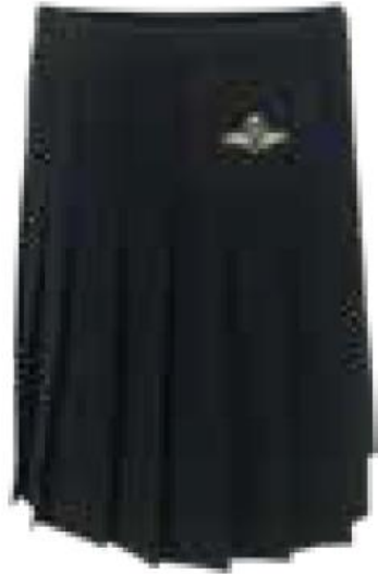
St Michael's pleated skirt with logo